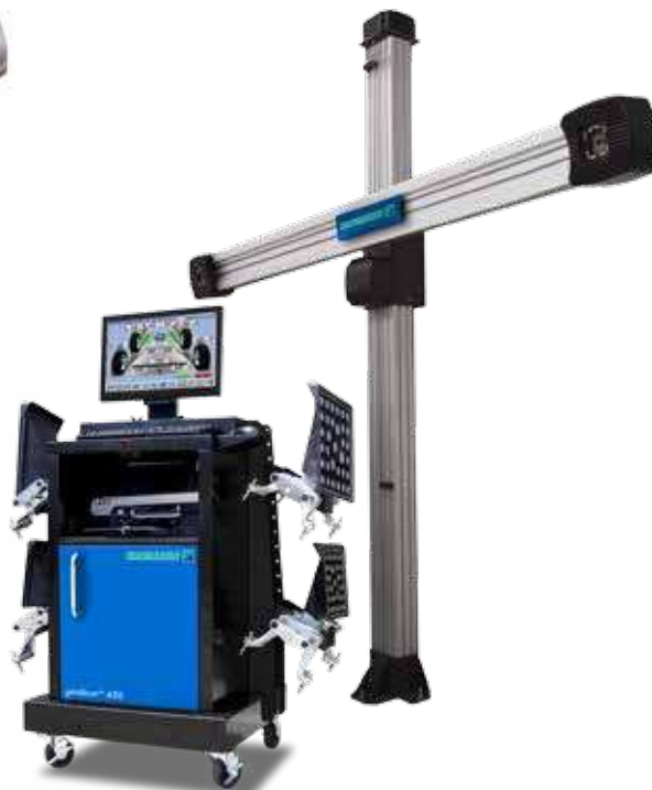
Hofmann geoliner 650 EEWA712AL