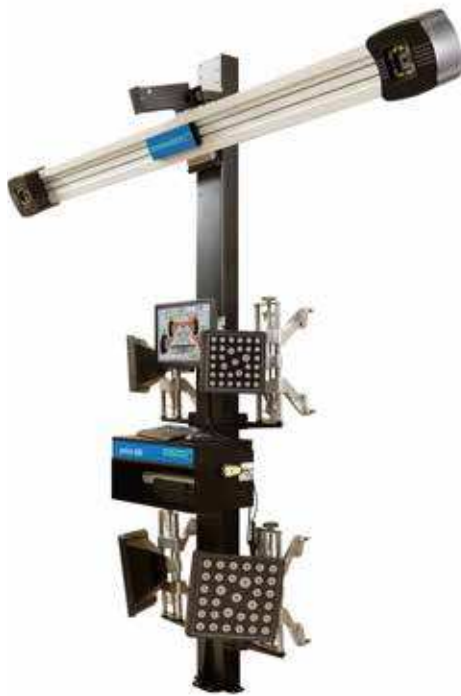
Hofmann geoliner 600 EEWA721AL